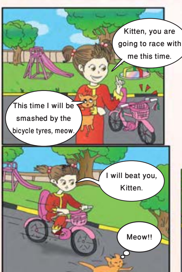
Illustration by/ Rawia Al-Khalilia