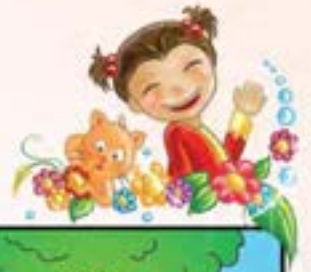
Illustration by/ Rawia Al-Khalilia